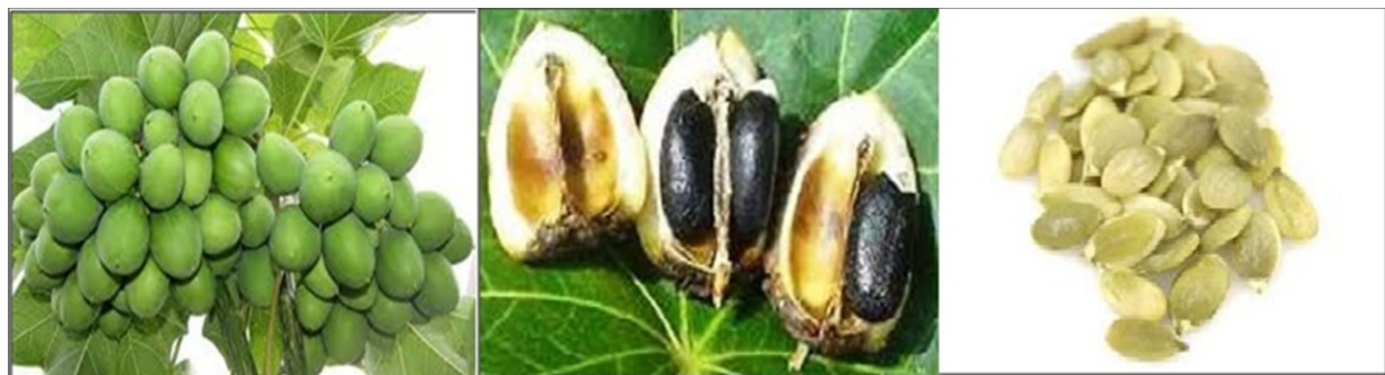
Fig. 2. The non edible feedstock “ Jatropha caurcas ”

The Jatropha seeds were obtained in bulk quantity from Pipri Model farm Karachi owned by PSO Pakistan. The Jatropha seeds were hard and of blue color. The Jatropha seeds were fresh and possessed the high moisture content. It was pretreated before oil expelling. The dirty white oil bearing mass was appeared after shell cracking